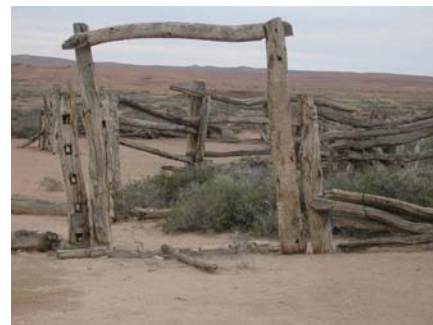
The old cattle yards

The rest of the week was involved in planting trees at Dalhousie and Breakfast Creek as well as the visitor survey and generally tidying up. We also went to Dalhousie ruins to photograph the cattle yards, and remove the Jose Feliciano bushes in the creek near the ruins very prickly!