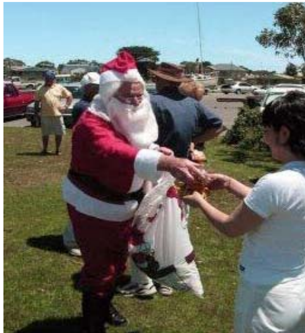
Thankyou Father Christmas.

After lunch Father Christmas arrived in the Rubber Ducky he was hanging on to his hat, he duly came ashore and handed out presents to everyone. He then left to go to his next appointment. It was an enjoyable day and thankyou to all that helped to set it all up.