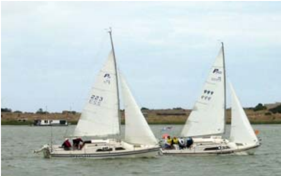
Cloud 9 and Fretless at the finish line

We woke next morning to the strong winds. We decided a reef was required it was duly put in. The lake was very lumpy due to the wind and the depth of water. The sail across to Point Sturt was wet to say the least. There was not any time for a relaxed lunch. The wind started to moderate at Clayton and some boats shook out a reef and gained extra speed. The race was run in a fast time and boats were back in Goolwa for a late lunch – early afternoon tea!